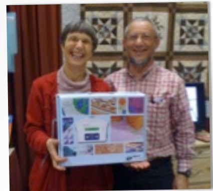
HAPPY QBOT QUILTERS