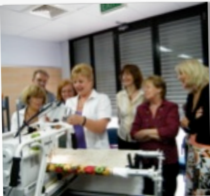
QBOT IS LAUNCHED IN AUSTRALIA