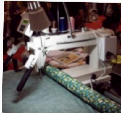
QBOT AT HOUSTON QUILT MARKET